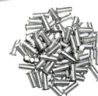
Aluminium Studs M4x15 Pkt.200 (16.178.01.24) Aluminium Studs M5x15 Pkt.200 (16.178.01.25) Aluminium Studs M6x15 Pkt.200 (16.178.01.26)