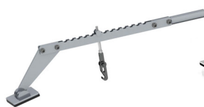
Deluxe Hand Lifter (13.155.30.28)