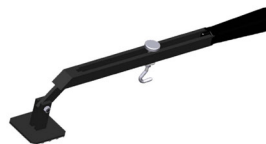
Standard Hand Lifter (13.155.30.05)