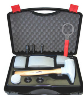
Aluminium Hammer & Dolly Kit (16.178.05.10)