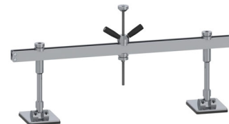
Straightening Bar (13.155.30.26)