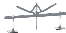
Pulling Bar (13.155.30.24)

AMH Canada Ltd, 391 rue Saint-Jean-Baptiste Est, Rimouski (Québec) Canada G5L 1Z2