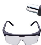
Safety Goggles (16.178.00.18)