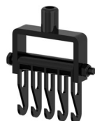
5 Finger Bear Claw (13.155.10.46)