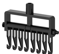
8 Finger Bear Claw (13.155.10.52)