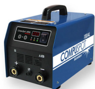
Dent Puller CompuSpot 180AL (28.CPS.181)