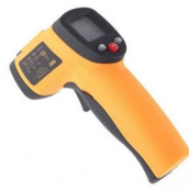
Infrared Laser Thermometer Sensor (16.178.05.25)